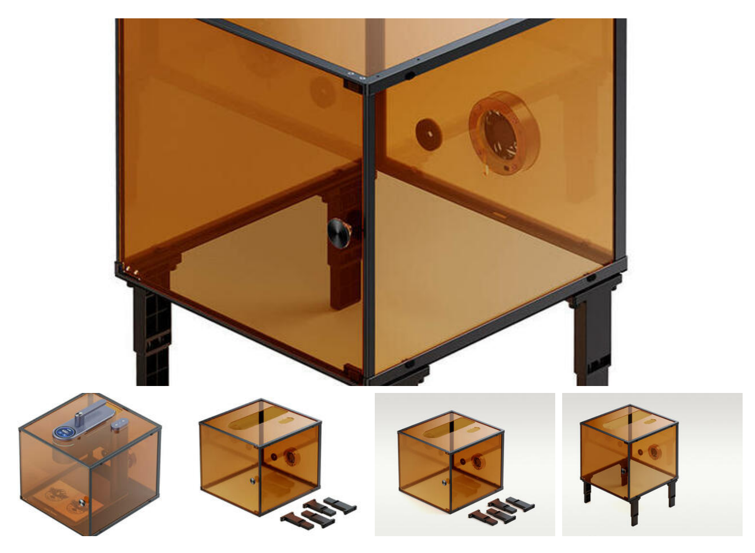
LaserPecker 2 / Protective Cover LaserPecker 2 / Protective Cover