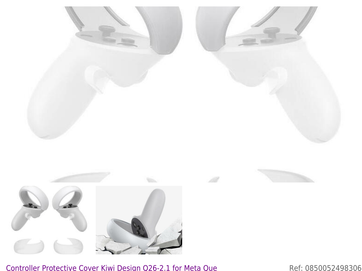
Controller Protective Cover Kiwi Design Q26-2.1 for Meta Que Controller Protective Cover Kiwi Design Q26-2.1 for Meta Quest 2 White

Kiwi Design Q26-2.1 protective controller cover for Meta Quest 2 white