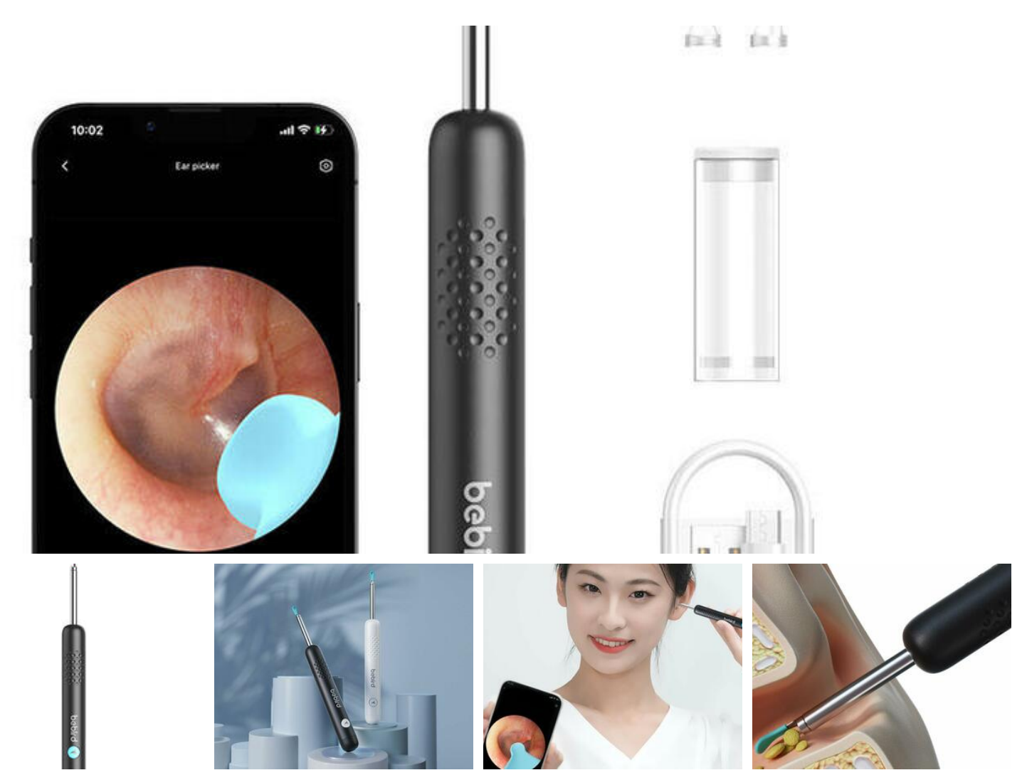
Smart Visual Ear-Clean Rod Bebird R1 black Smart Visual Ear-Clean Rod Bebird R1 black

Bebird R1 ear cleaning otoscope with camera (black).