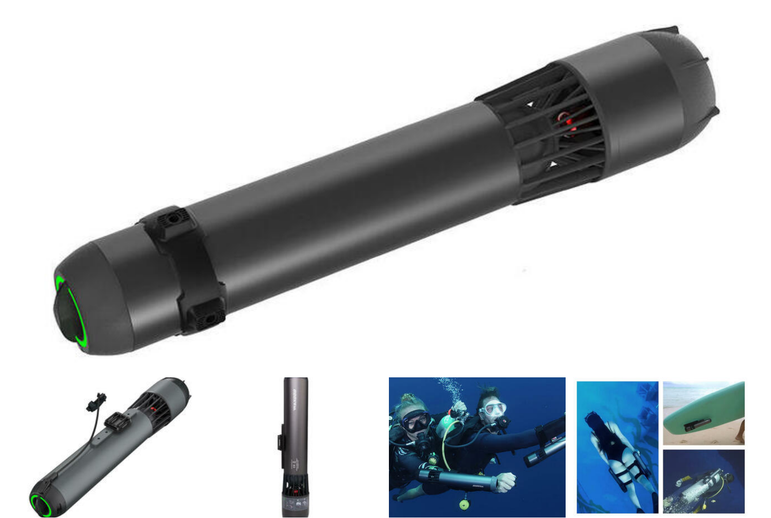
Waydoo submersible Waydoo submersible