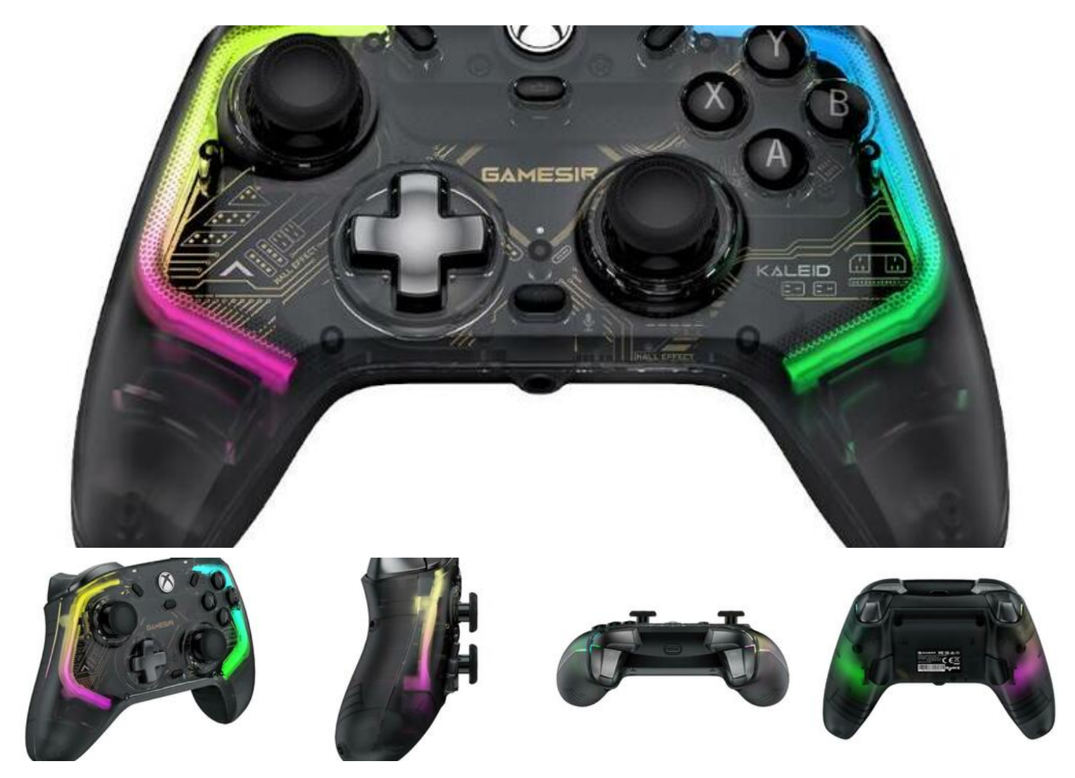
Wired controller GameSir K1