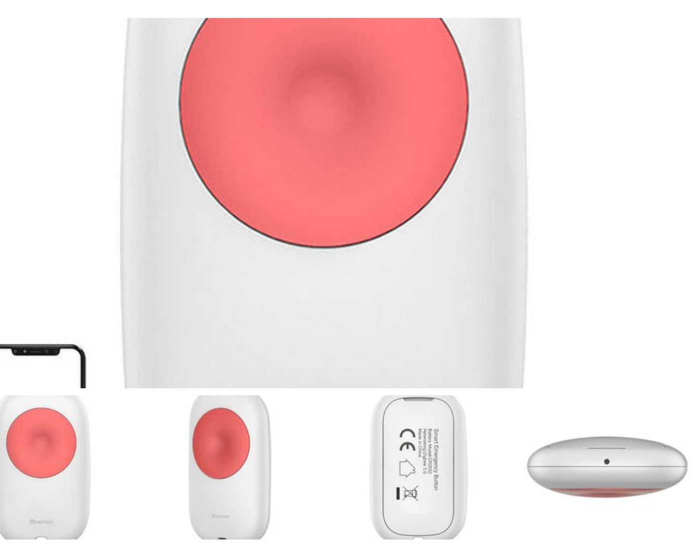
ZigBee Heiman HS1EB smart emergency button ZigBee Heiman HS1EB smart emergency button