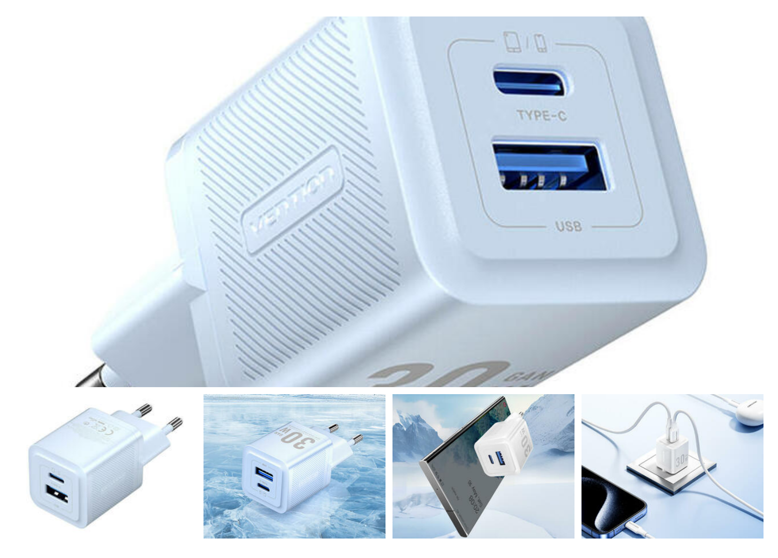
Wall charger, Vention, FEQL0-EU, USB-C + USB- A, 30W/30W, Wall charger, Vention, FEQL0-EU, USB-C + USB- A, 30W/30W, GaN (blue)

Power charger, Vention, FEQL0-EU, USB-C, USB-A, 30W/30W, GaN (blue)