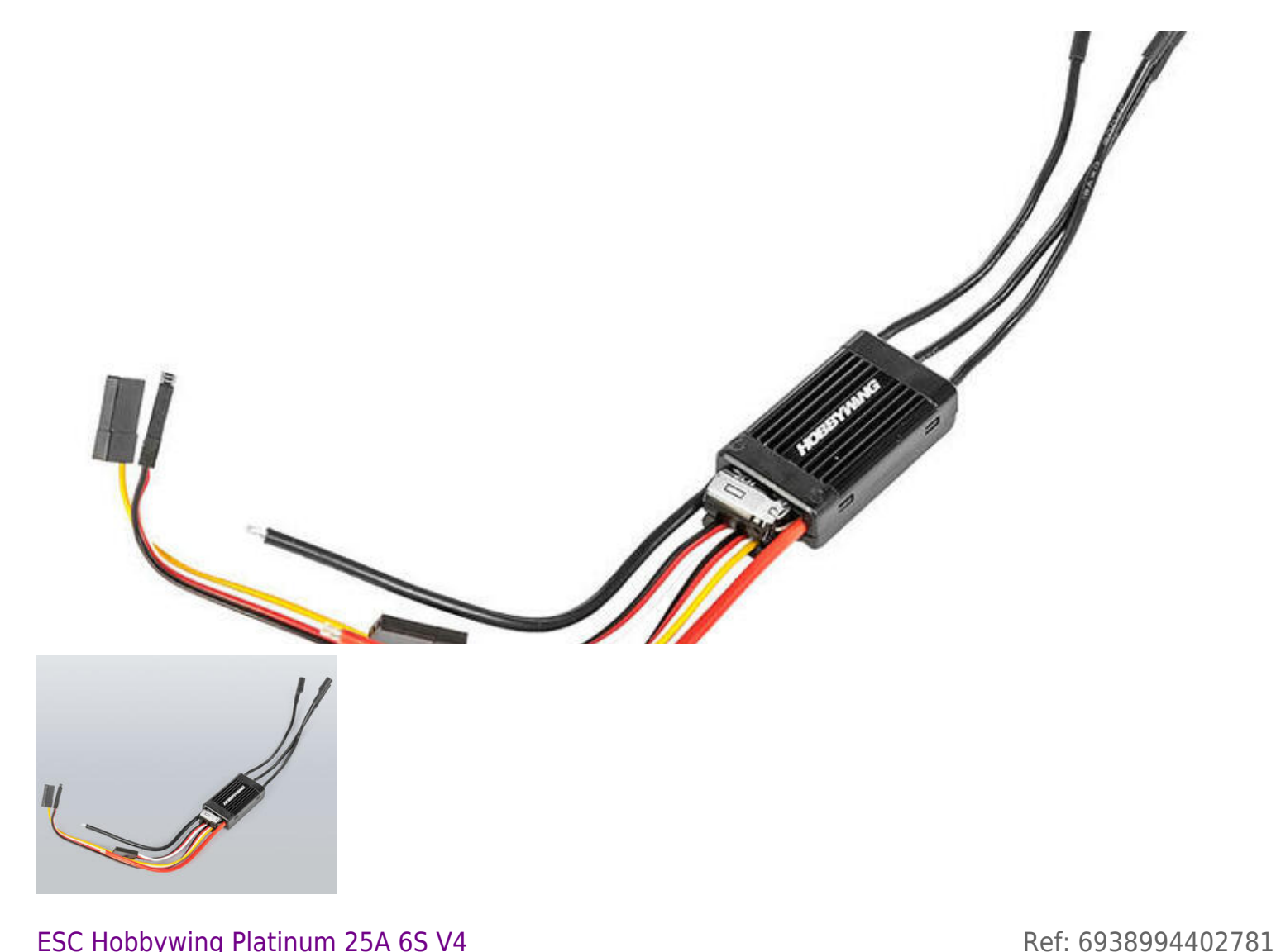
ESC Hobbywing Platinum 25A 6S V4 ESC Hobbywing Platinum 25A 6S V4