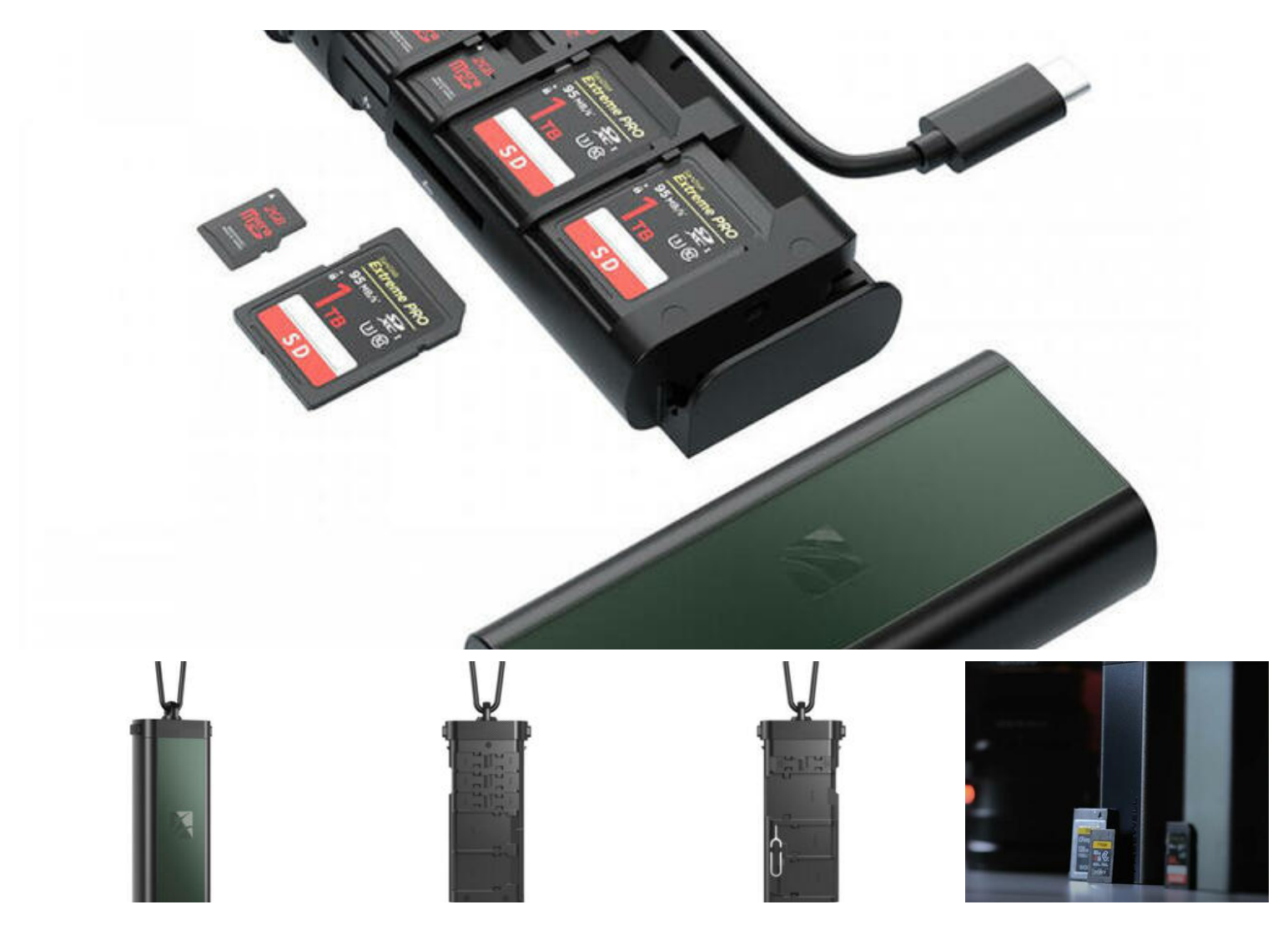
Duo Card Reader SD, TF Freewell Duo Card Reader SD, TF Freewell