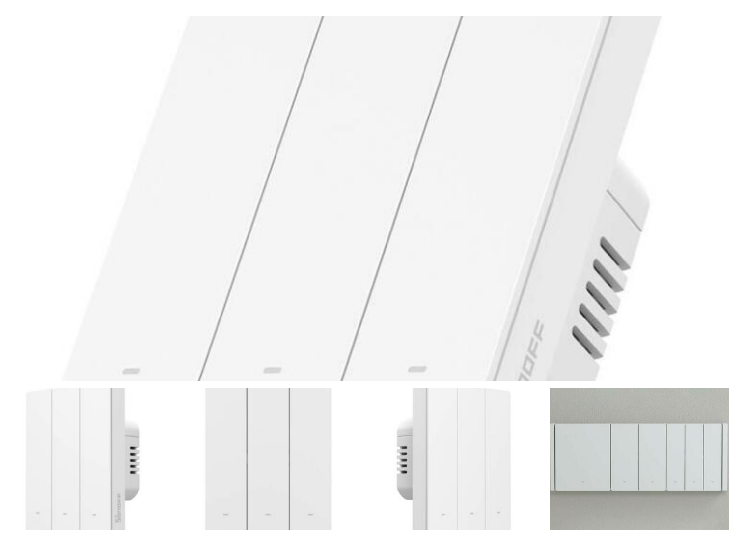
M5-3C-80W WiFi Matter smart wall switch (3-channel, for fram

M5-3C-80W WiFi Matter smart wall switch (3-channel, for frame)