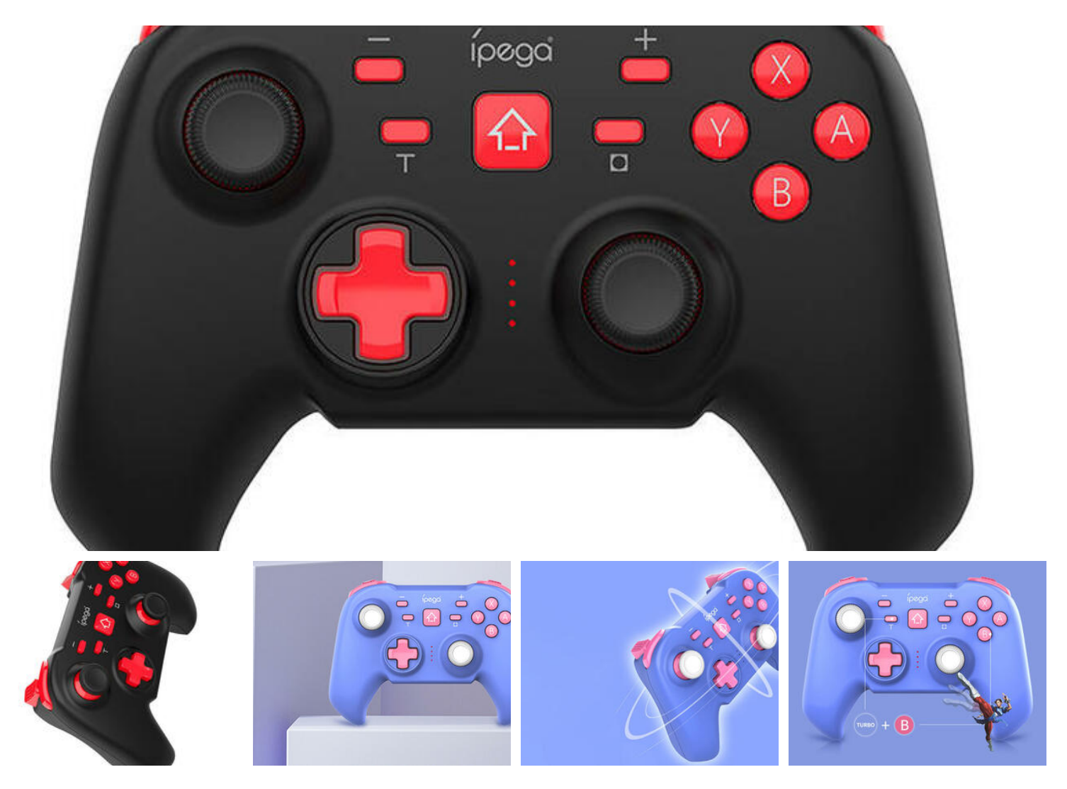
Wireless Gaming Controller iPega PG-SW062A Nintendo Switch (Wireless Gaming Controller iPega PG-SW062A Nintendo Switch (

iPega Nintendo Switch Wireless Controller/GamePad PG-SW062C